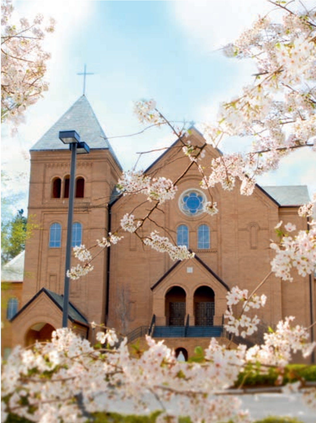
Cherry Blossoms in bloom

Fifth Sunday of Easter V Domingo de Pascua