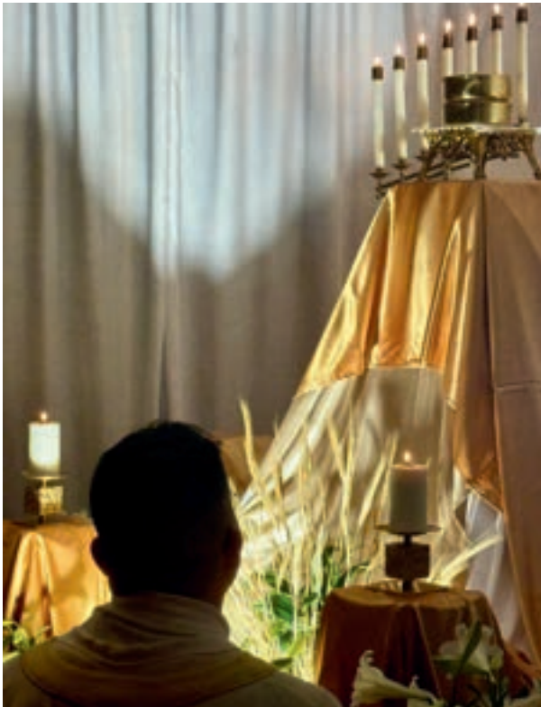
The Altar of Repose on Holy Thursday

Request Mass Intentions at massintentions@hscat1.com