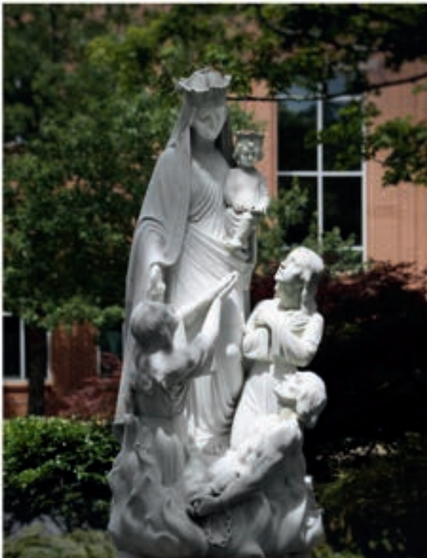
The Marian statue in front of Holy Spirit Prep.

Request Mass Intentions at massintentions@hscat1.com