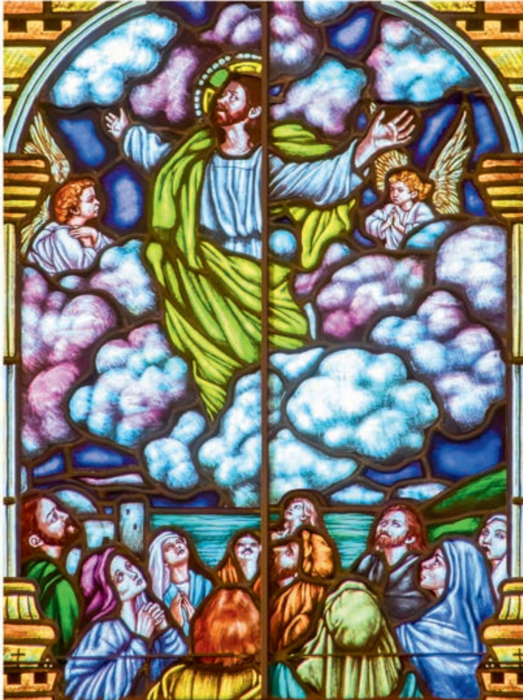
The Ascension of the Lord window, located behind the Altar in the Church

Solemnity of the Ascension of the Lord Solemnidad de la Ascensión del Señor