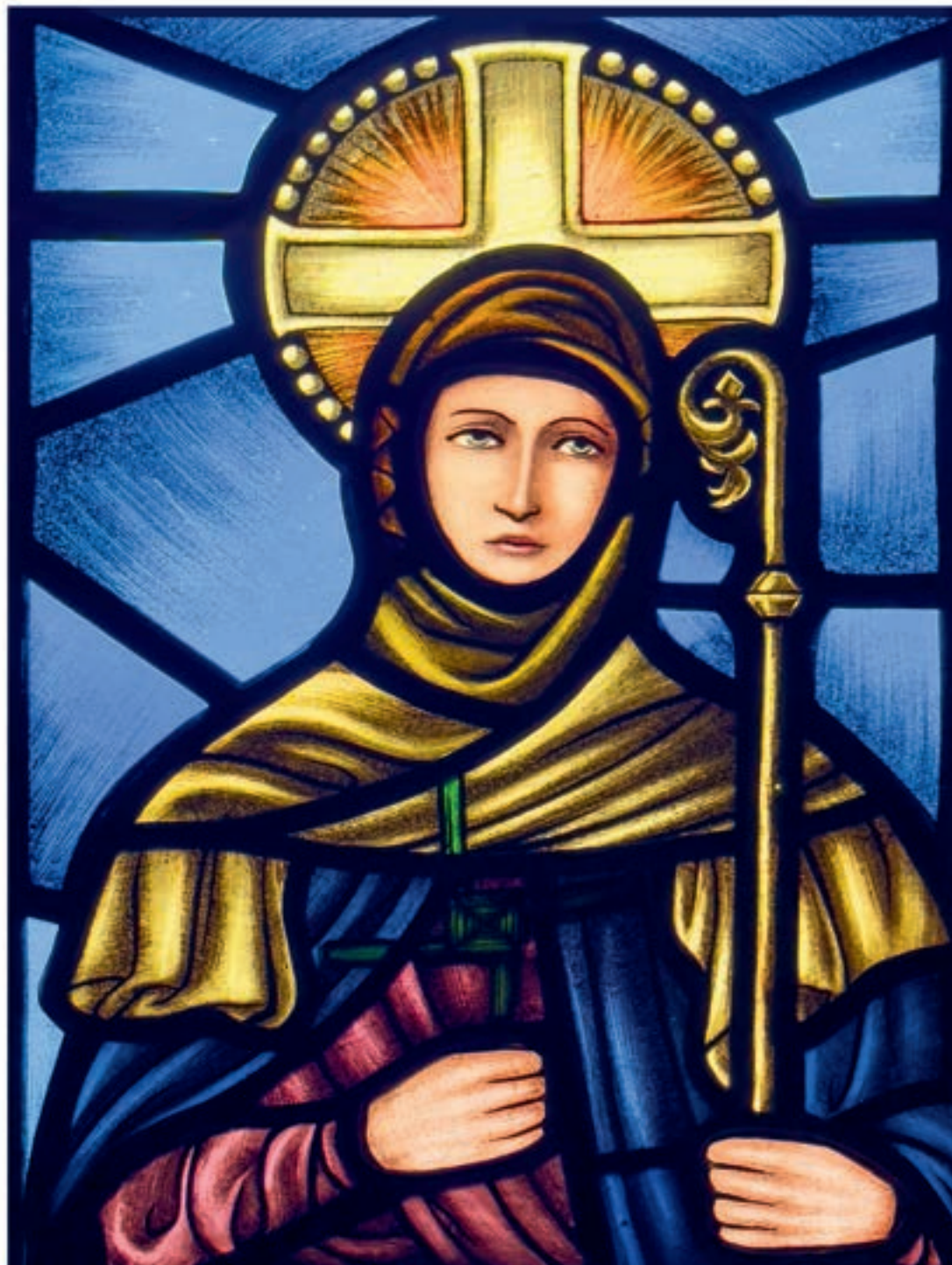
St. Brigid of Kildare, Feast Day February 1, Right Side of the Chapel

Fourth Sunday in Ordinary Time IV Domingo Ordinario