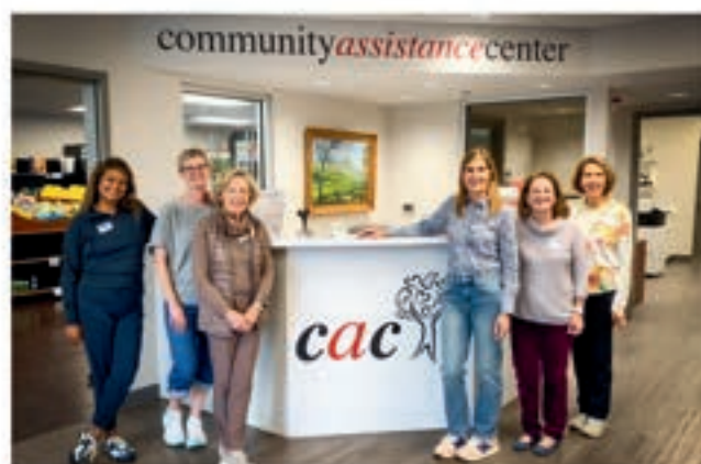
Members of the Women's Club volunteered at the Community Assistance Center as part of a service project.