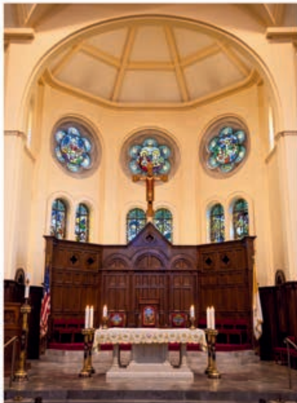
The altar area of the Church.