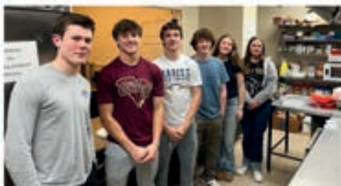
Teens serving at St. Francis Table Soup Kitchen

Phoenix is Holy Spirit's high school youth ministry program open to all 9 th - 12 th graders. Below are our upcoming events: