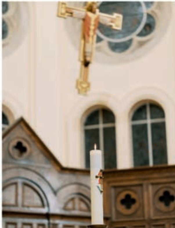
The Paschal candle.